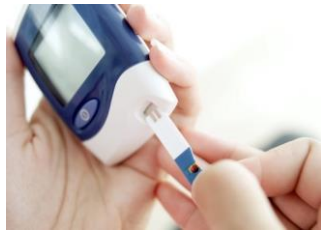
▲ Blood Glucose Meter and more...