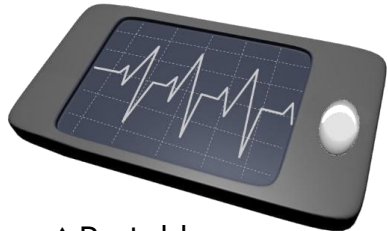
▲ Portable Electrocardiograph